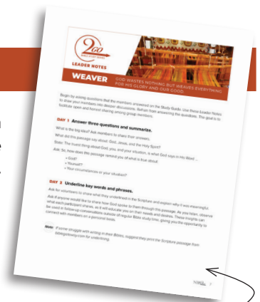
Leader Notes pages 7 - 8

Keep this tool with you to enhance the Study Guide.